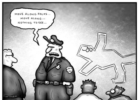
The Death of The Invisible Man

One day, there was a little native American boy, and he asked his chief, "how did running bear get his name?" and the Chief said "well at the time he was born, his parents saw a bear running and decided to call him running bear." then the little boy said "well what about Snake in the grass?" "well when he was born his parents saw a snake in the grass and they decided to call him Snake in the grass." He went through the whole list of villagers and when he was through with the list the chief said "There, does that answer all your questions 2 Dogs Humping?"