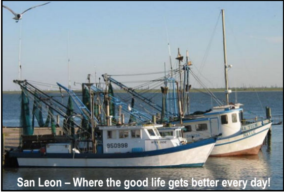
San Leon – Where the good life gets better every day!