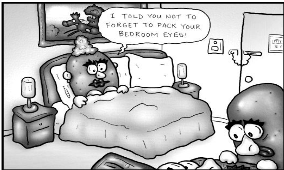
The Potato Heads' vacation disaster

STEVE'S COLUMN IS MEANT TO BE HUMOROUS – PLEASE DON'T TAKE IT TOO SERIOUSLY