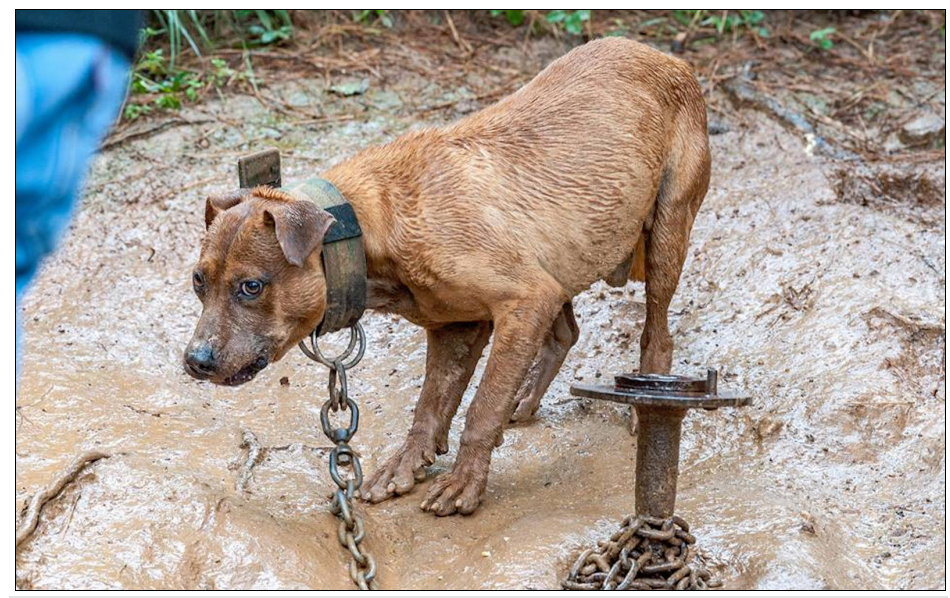
fighting end up being "put It looks like a dog fighting ring has been broken up in Dickinson, down" because they can't where over 30 dogs were seized last week. The investigation is still underway, and we will let our readers know if and when charges are Unfortunately, most dog filed. The dogs taken were all living in deplorable conditions, some of

fighting offenses in Texas them without food or water. are still misdemeanors, and